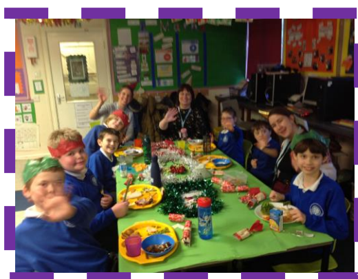
Squirrels' Christmas Lunch!

We wish everyone a safe and happy holiday and a very